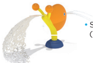
• Snail N°4 (VOR 7217)