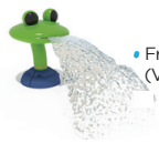
• Frog N°1 (VOR 7200)