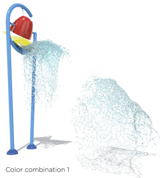
Color combination 1