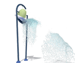
Color combination 3