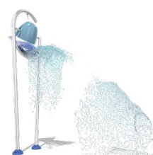
Color combination 4