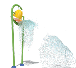
Color combination 2