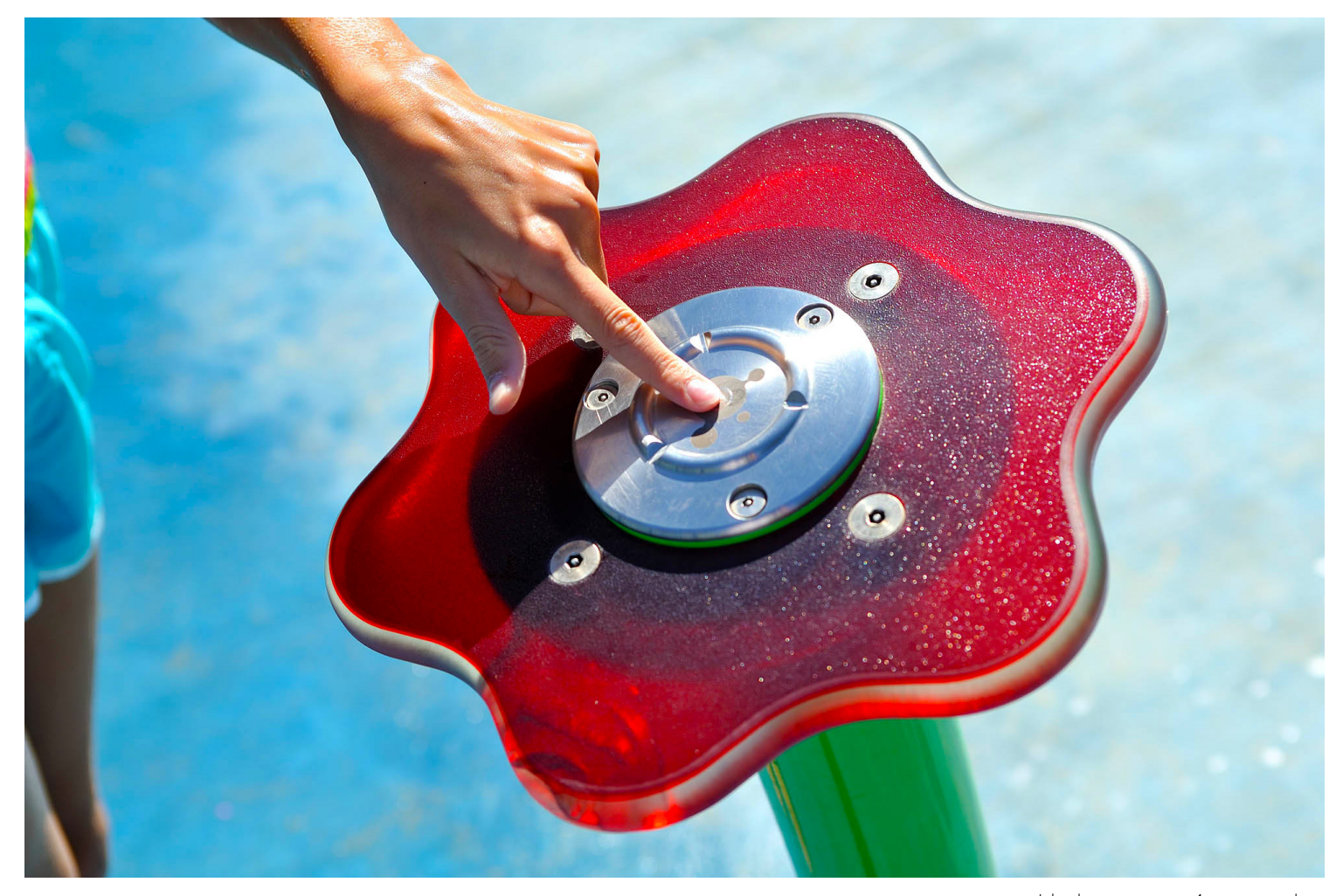
Ideal age group: 4 years and up